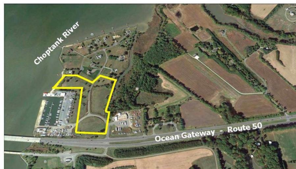
Commercial Development Property - Frontage on Route 50 & The Choptank

Land: 10.5 acres Zoning: L.C. Talbot County Designation for Limited Commercial Legal: Tax Map 62; Grid 19; Parcel 42 West Side Route 50 (Ocean Gateway) Liber 581 Folio 792 Deed Ref.: Price: $950,000.